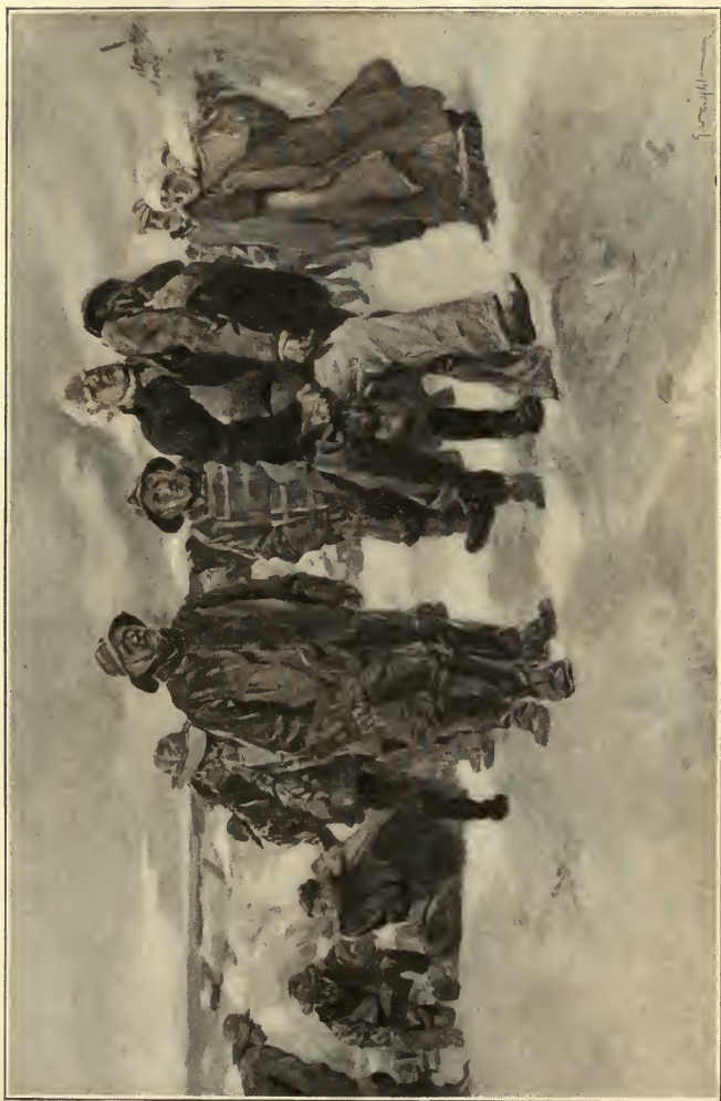
The Captain started up the dune with the bedraggled body of the unconscious man.